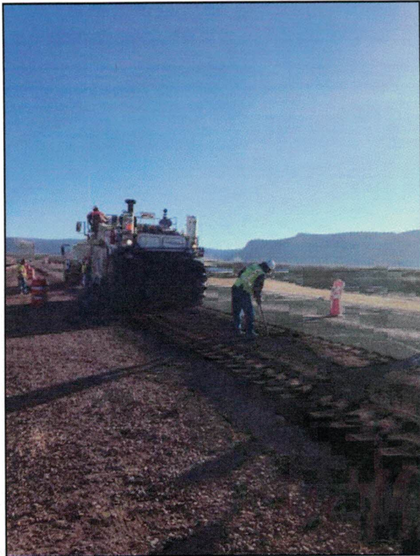
Full depth reclamation of existing road on the Trail of the Ancients